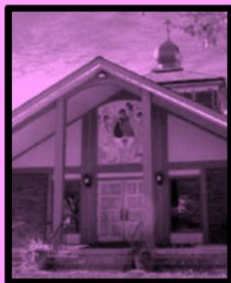
HOLY TRINITY ORTHODOX CHURCH