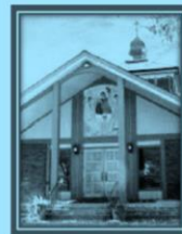
Holy Trinity Orthodox Church

The purple Stewardship Bulletin offers information about what stewardship is (it is not just about money), our vision for what the parish can do in the short and long-term future with even stronger stewardship, and a "giving grid" to help calculate percentage giving.