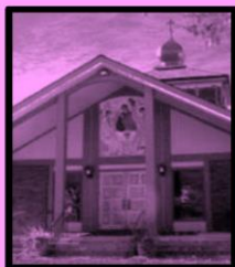
HOLY TRINITY ORTHODOX CHURCH