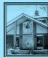
Holy Trinity Orthodox Church

The purple Stewardship Bulletin offers information about what stewardship is (it is not just about money), our vision for what the parish can do in the short and long-term future with even stronger stewardship, and a "giving grid" to help calculate percentage giving.