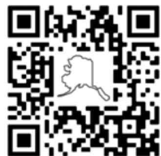
QR Code to View Bishop Alexei’s Presentation on the Diocese of Alaska

We will take a Special Collection the next three Sundays for the Alaskan Clergy Fund. Please be as generous as you can.