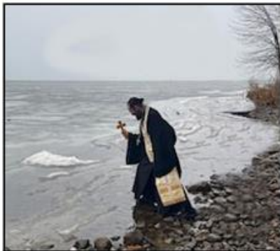
The annual Blessing of the Waters - Oneida Lake, January 2024.

Visit us at https://www.standrewscamp.org , or https://www.facebook.com/saintandrewsorthodoxcamp.org